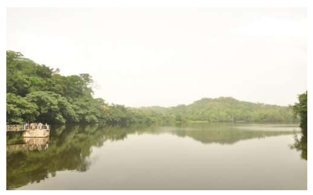
Fig. 2: Eleyele Reservoir surrounded by Awotan Hills

According to Chief Okunola (2015), the founding Odu or Ifa sign for the city (each and every legitimate Yoruba Town always has his founding Odu ), is Osemeji , a uniform, binary accreditation which predicted that like the totemic snail, the emerging city of Ibadan would unfold slowly but progressively until it subsumes its own ramifying suburbs. This is analogous to its Coat of Arms (see the traditional stave).