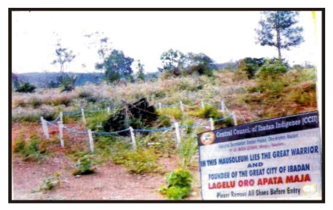
Fig. 1: The Grove of Lagelu at Eleyele Hill